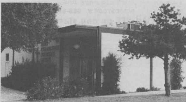
THE ST. ANTHANASIUS CHURCH in Isla Vista

In summary, the EOC is not insidious, but it is organized. Their influence in Isla