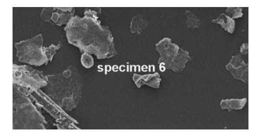
The fossil imagery data curation pilot project at UCSB includes archival storage of microscopic images of rock specimens.

The Data Curation @ UCSB Program has reached the next phase in its investigation of how to manage massive amounts of raw digital research data generated on campus. Up next is a series of three pilot projects in which UCSB Library will provide data curation