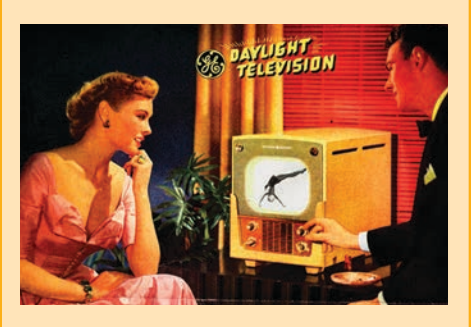
The American Consumer Culture database includes marketing materials for mid-20thcentury U.S. businesses, like this 1949 ad for a G.E. "Daylight Television."

The Library has purchased access to the following online databases: