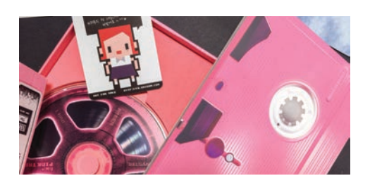
Korean pop music ephemera

K-Pop Material Culture and Global Fandom 8th Floor Lobby Through May 29, 2015