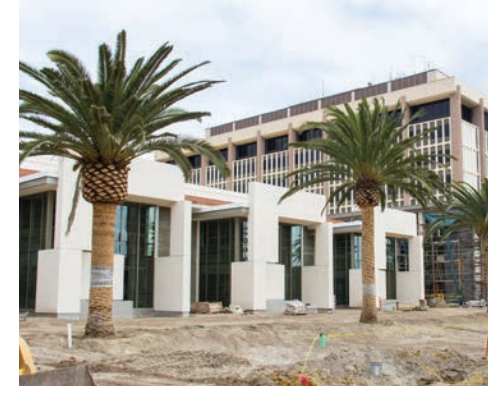
With scaffolding down and new palm trees out front, the Library's three-story addition and twostory renovated building (left) are emerging from their construction cocoon.

The Library's new face is emerging. The future main entrance, the Paseo, which connects the newer parts of the Library to the older, is scheduled for completion in September.