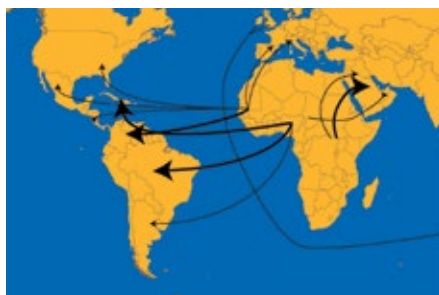
In Africa and the Americas: The Legacy of the Diasporas Ethnic & Gender Studies Collection