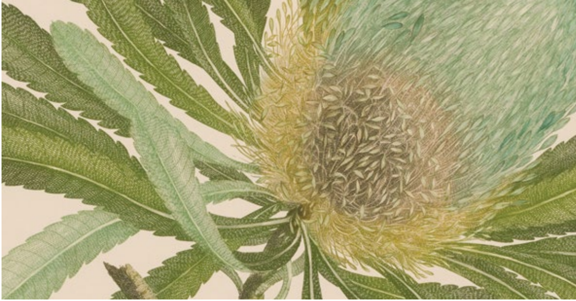
Detail of Banksia serrata from plate 285 of Banks' Florilegium .