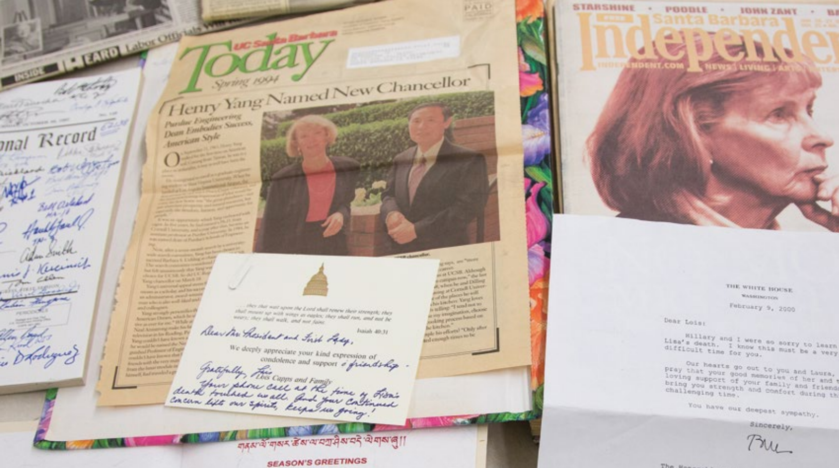
The papers of U.S. Congresswoman Lois Capps.