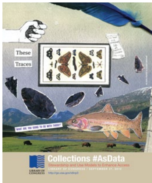
Collections As Data Poster commissioned by the Library of Congress. (Oliver Bendorf)

From March 1-3, thirty leading experts descended on UCSB Library to begin development of a national strategy for making digital cultural heritage collections (eg. photos, audio recordings, movies, manuscripts, websites, artwork, and maps) more amenable to computational analysis and representation via visualization and other means. Always Already Computational: Library Collections as Data was made possible by a $100,000 National Forum grant awarded by the Institute of Museum and Library Services. The project team consists of Principal Investigator Thomas Padilla (UCSB Library, Humanities Data Curator), Co-Principal Investigator Laurie Allen (University of Pennsylvania), and Co-Investigators from University of Pennsylvania, Texas A&M, Stanford University, and Emory University.