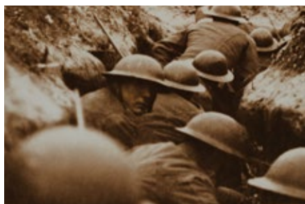
Helmets from the Great War (1914-1918): Battle, Technology, and Culture Mountain Gallery