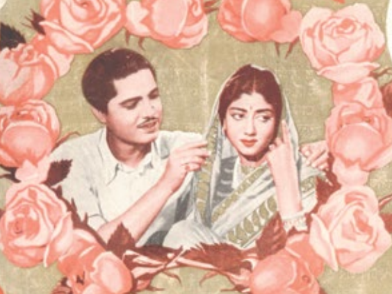
Detail from leaflet for Swashur Bari (1953) from the South Asia Archive.