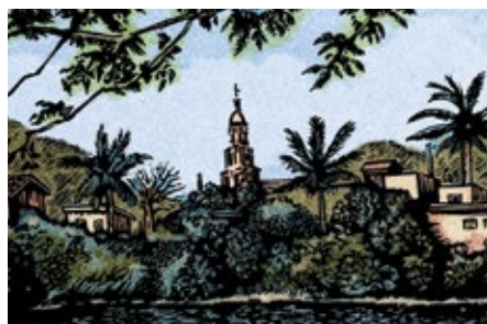
Recuerdos de Rosario (Memories of Rosario) Ocean Gallery