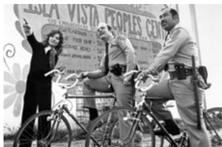
Isla Vista—Building a Community, 1970-2016 Special Research Collections