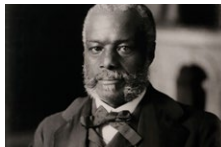
14 Black Classicists Mountain Gallery