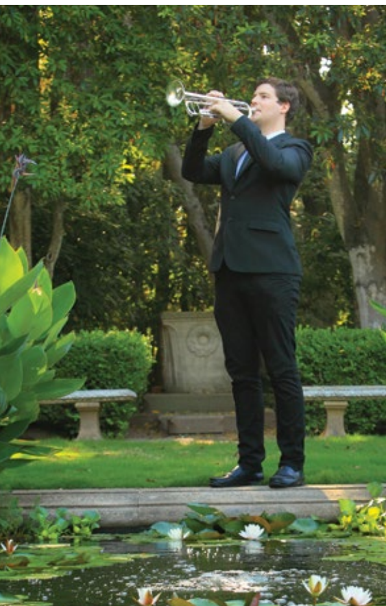
The Music Academy of the West’s archives are coming to UCSB.