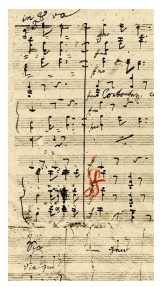
"Ludwig van Beethoven: Symphony No. 9." This facsimile of the composer's manuscript is located in the Music Library and can be viewed on request.

The Music Library remains open and fully functioning in the Music Building complex, for now. It is still on the 2nd Floor of what was once the Arts Library. The Art Collection has moved to the 1st Floor Mountain Side of the main Library and is now called the Art & Architecture Collection.