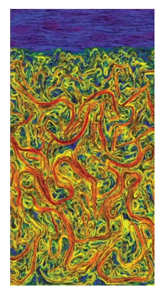
Art of Science Through Summer 2016 Tower Gallery, 1st Floor, Ocean Side