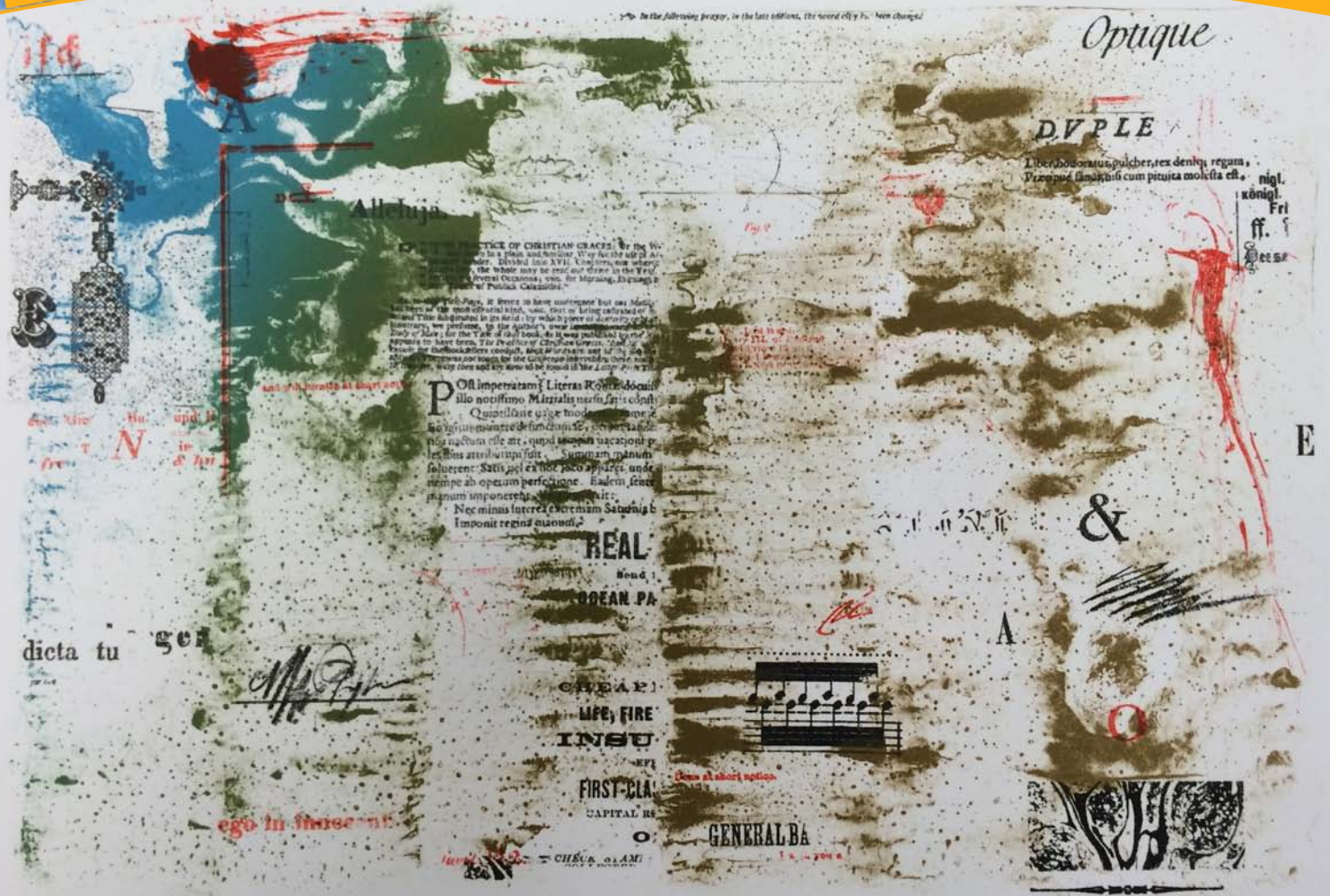
Progressive proof of "Authorized to run rainbow" with plates I, II & III, 1971. (William Dole Papers FacP 52)

(Above): Special Collections has completed processing the papers of William Dole (1917-1983), a prominent American collage artist and former art professor at UCSB. See page 7 for more.